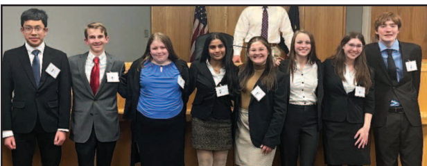
Gray Stone places second in regional competition. See 5A.